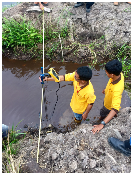
The SonTek FlowTracker2 Handheld ADV is used to quantify discharge through the canals. In channels where the water is very slow, the highly accurate ADV is used to ensure hydrological discharge data collected is accurate.

After the success of the proof of concept, Sinar Mas invested in Sontek Flow Tracker 2 and M9 Riversurveyor systems to complement their water management programs.