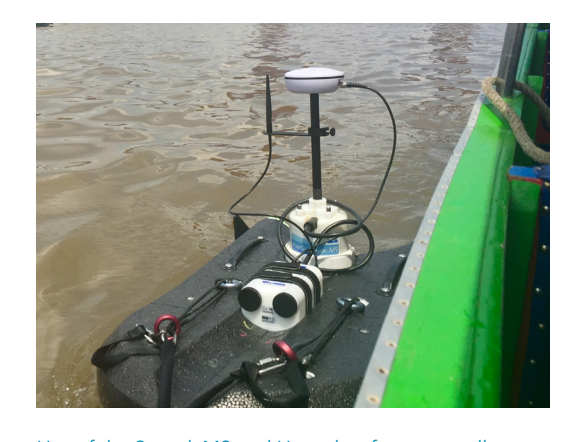
Use of the Sontek M9 and Hypack software to collect bathymetric data at Baung, Palembang for a navigable section of the river leading to the Paper Mill jetty.